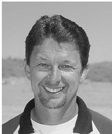
USPSA President and multi-year USPSA 3-Gun Champion Michael Voigt.

test, and rules changes spearheaded by Voigt tightened up the allowed equipment, bringing USPSA competition more in line with Soldier Of Fortune (now reborn