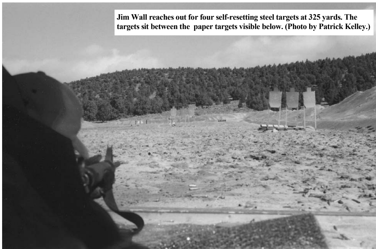
Jim Wall reaches out for four self-resetting steel targets at 325 yards. The targets sit between the paper targets visible below.

Instead of molded plastic flags, Patrick Sweeney passed on this suggestion from the clubs in Michigan. Before your match, purchase a reel of brightly-colored 1/4” rope. Cut the rope into 18-inch sections, and have them available at registration. (An old soldering iron works well if you use nylon or polypropylene.) Tie a knot on one end of the rope, and drop the loose end of the rope through the ejection port and down through the magazine well on a rifle. The knot should hold the rope in place, since it won’t